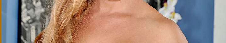
Sexy Beauty Pageant Is A Shemale! She Shows Her Di...